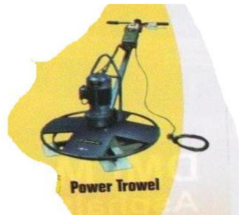
Power Trowel & Power Flotter For Finishing

The bottom surface where concreting is to be carried out shall be cleaned & leveled. Nut bolt & M.S. shall fix side rails of M.S. side as per thickness of the road as per the width of road, rail shall be oiled before concreting to get surface